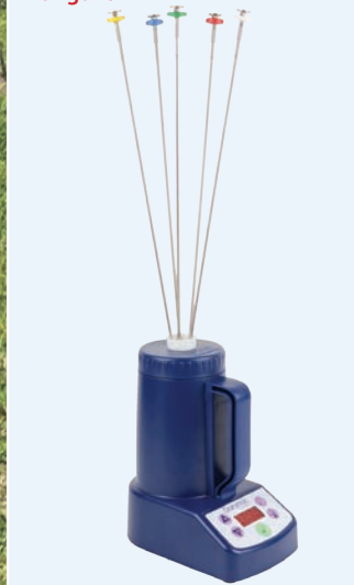
AI gun warmer dry chamber with guns