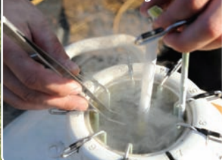
Frozen straws in nitrogen